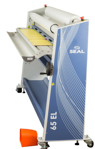
Shown with optional leveling feet, image guide and roll trough