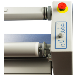
Ergonomic control panel for ease of use.