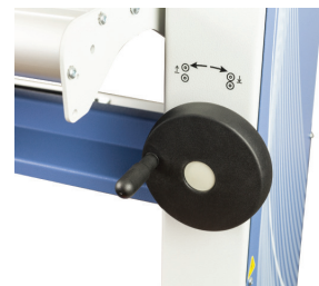
Manual nip adjustment with height gauge for precise operation.