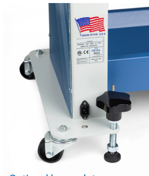
Optional heavy duty rear stabilizing feet.