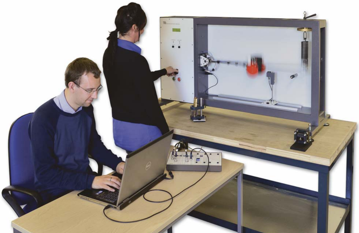
SHOWN CONNECTED TO VDAS®