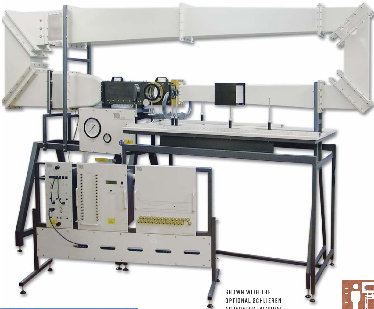
SHOWN WITH THE OPTIONAL SCHLIEREN APPARATUS (AF300A)

Investigates subsonic and supersonic air flow, including flow around two-dimensional models.